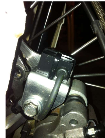
Picture 1. Radio Box on top of brake caliper.